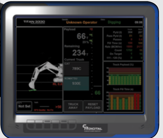
SIMPLE, INTUITIVE USER INTERFACE (UI)